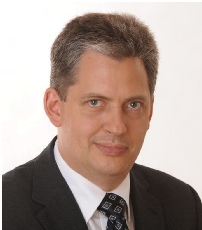
Jiří Dienstbier. [2]

[2] Jiří Dienstbier.