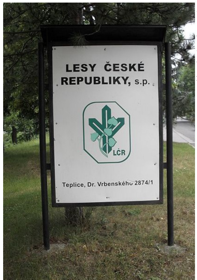
Lesy České republiky, Teplice. [1]

In 2010 the law firm Prague Attorneys took charge of the case and filed a criminal complaint