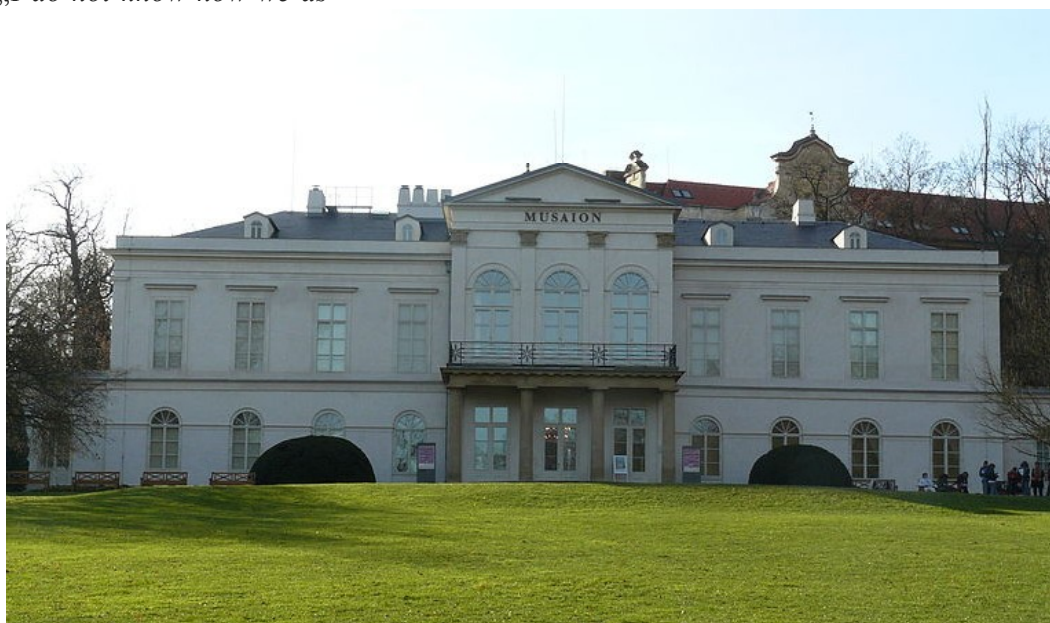
Kinsky villa, Praha Smíchov. [1]

[1] Kinsky villa, Praha Smíchov.