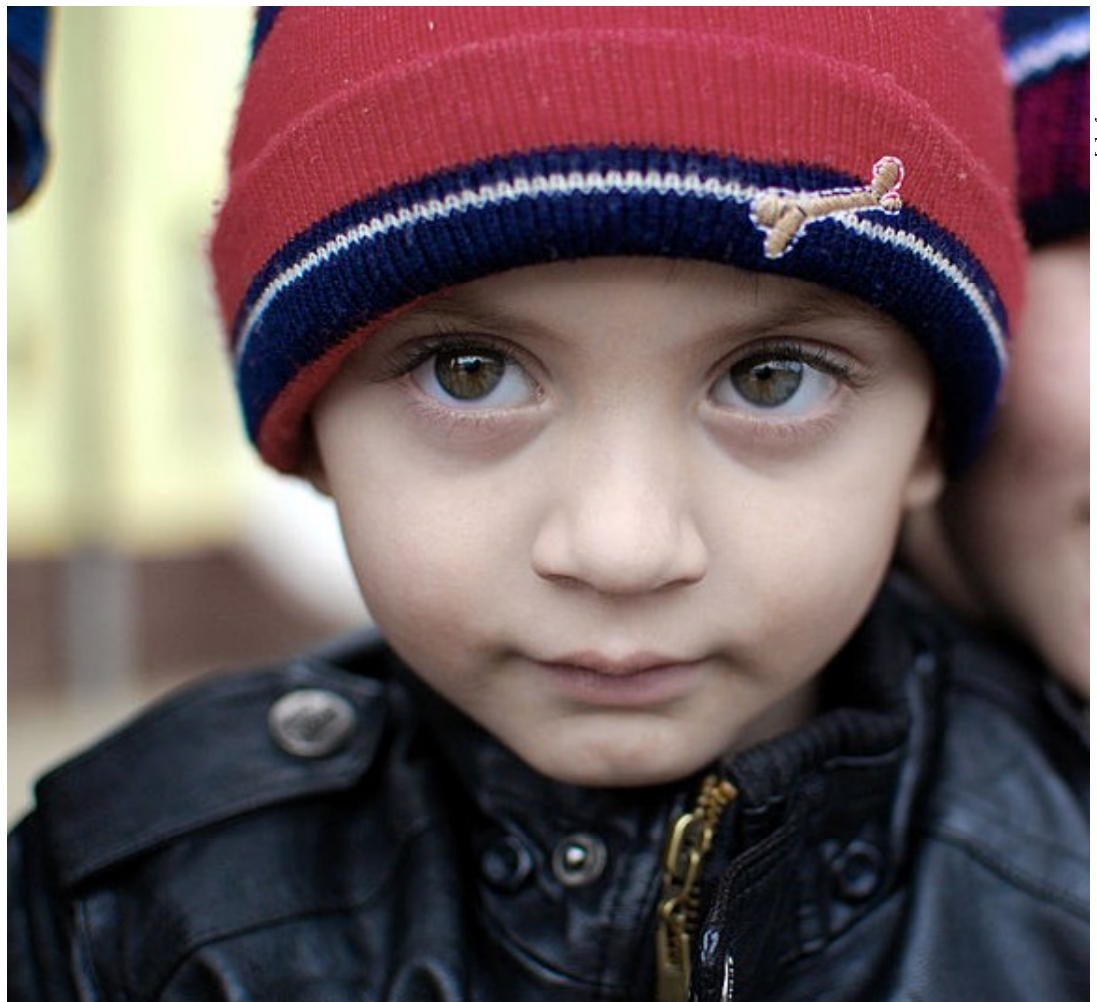
Romanian boy. [1]

[1] Romanian boy.