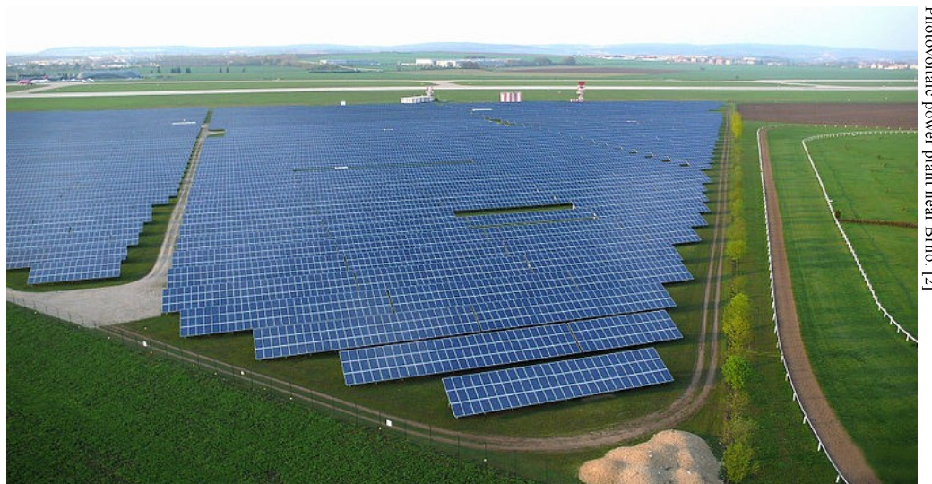
Photovoltaic power plant near Brno. [2]

[2] Photovoltaic power plant near Brno.