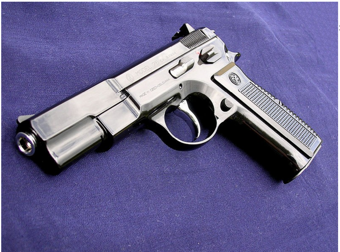
Gun CZ 75. [2]

[2] Gun CZ 75.