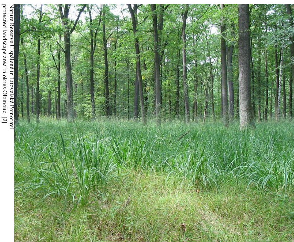
Nature Reserve U spálené in Litovelské Pomoraví protected landscape area in okres Olomouc. [2]

[2] Nature Reserve U spálené in Litovelské Pomoraví protected landscape area in okres Olomouc. Author: Michal Mañas, Wikipedia Commons.