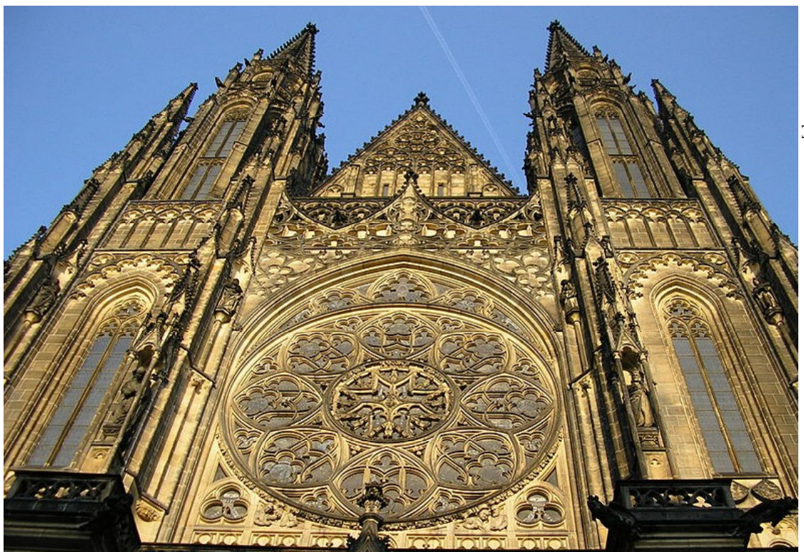
Church of St. Vitus. [1]

[1] Church of St. Vitus. Author: Stanislav Ferzik, Wikipedia Commons.