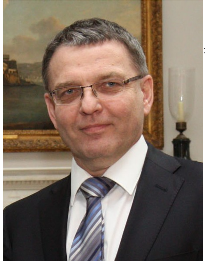
Lubomír Zaorálek. [1]

On another front pertaining to the business-human rights conflict, the Minister of Foreign Affairs of the Czech Republic, Lubomír Zaorálek, went for an official visit to China to strengthen relationships with the Empire of the Middle. It was the first visit of the Czech Minister of Foreign Affairs to China in fifteen years. Lubomír Zaorálek stated that the restoration of normal relations with China doesn’t mean