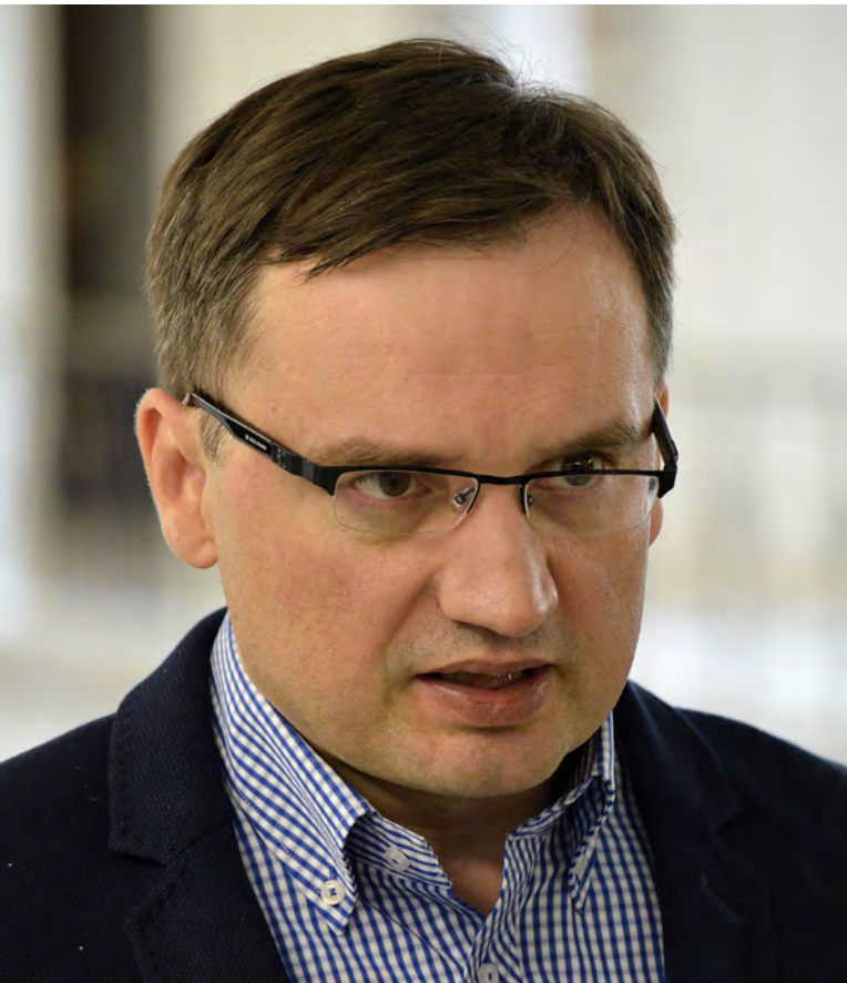
Mr. Zbigniew Ziobro, Minister of Justice [3]

highly controversial legal and institutional arrangements. Although the Senate (upper house of the Parliament) rejected the much-criticized bill, the Sejm (lower house) overruled the Senate's resolution and the bill was sent to the President for his signature. The Bill was signed by the President, promulgated and entered into force on 14 February 2020, with the exception of two provisions.