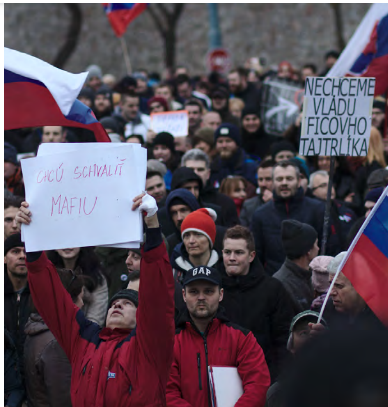
Protests against the Slovak government [1]