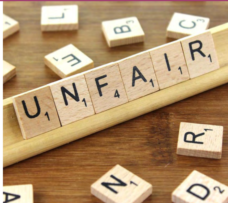
Illustration image [1]

Back in 2011, when the ombudsperson investigated the issue of the paramilitary marches, they received further complaints about systemic discrimination, in particular