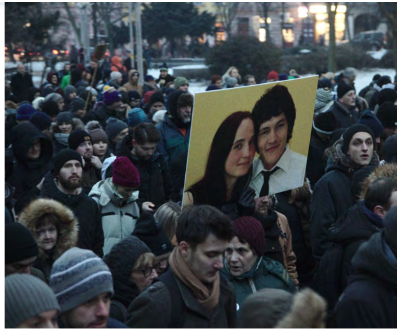
Demonstration in memory of murdered journalist and his fiancée [5]

ussion about the limits of ethical behaviour, then judges do not know how to react when faced with a dilemma.