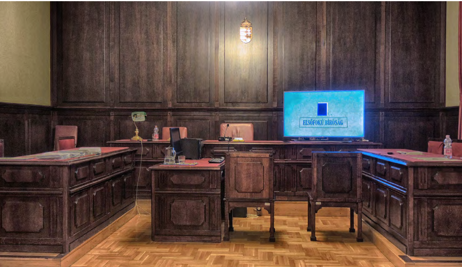
Palace of Justice on the European Heritage Days [3]