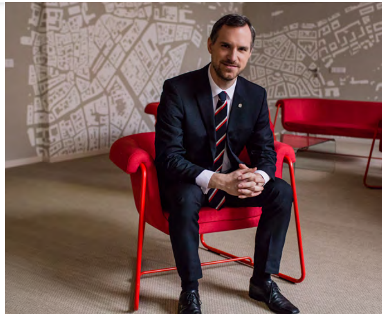
Zdeněk Hřib, Mayor of Prague

Karácsony is, however, not alone in his opposition to the political orientation of his government. The president of Slovakia, Zuzana Čaputová, expressed grave concerns in her recent speech at the Munich Security Conference. She spoke of irresponsible leaders of the V4 countries who pose a danger to the rule of law and democratic values. While it remains to be seen whether capital cities could become liberal safe havens in countries turning to illiberalism, the conclusion of the Pact might be the first step in this direction.