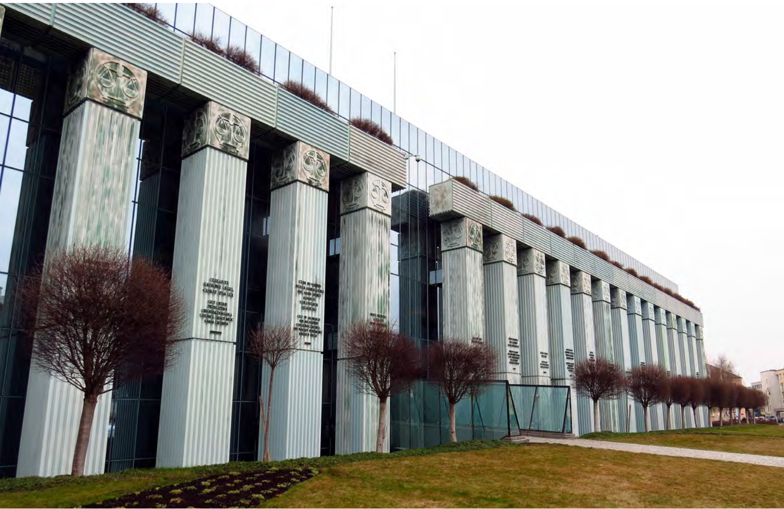
Supreme Court of Poland [2]

The Labour Chamber of the Supreme Court must determine whether that applies to a court such as the Disciplinary Chamber. The principle of the primacy of EU law must be interpreted as requiring the Labour Chamber to disregard such provision of national law which reserves jurisdiction to hear and rule on cases to a court which is not independent and impartial.