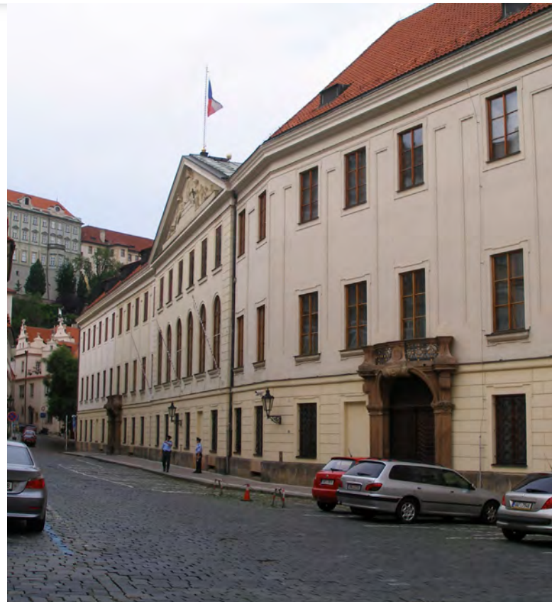
The seat of the Chamber of Deputies [1]

The counter-draft of the opposition concerns an amendment to Article 32 paragraph 1 of the Czech Charter of Fundamental Rights and Freedoms, which governs the protection of the family and parenthood. The proposal would alter this Article and would enact marriage as a permanent union of a man and a woman at the constitutional level.