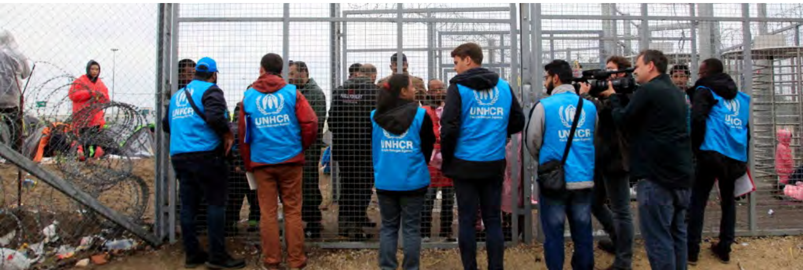
Volunteers of the UNHCR visiting the Rösztke and Tompa detention zones [3]

consequence of leaving would be the discontinuation of the applicants' asylum proceedings in Hungary, and for that reason one cannot interpret the situation as detention. Therefore, “the applicants were not deprived of their liberty within the meaning of Article 5.” The two applicants have been granted EUR 5,000 for non-pecuniary damages.[2]