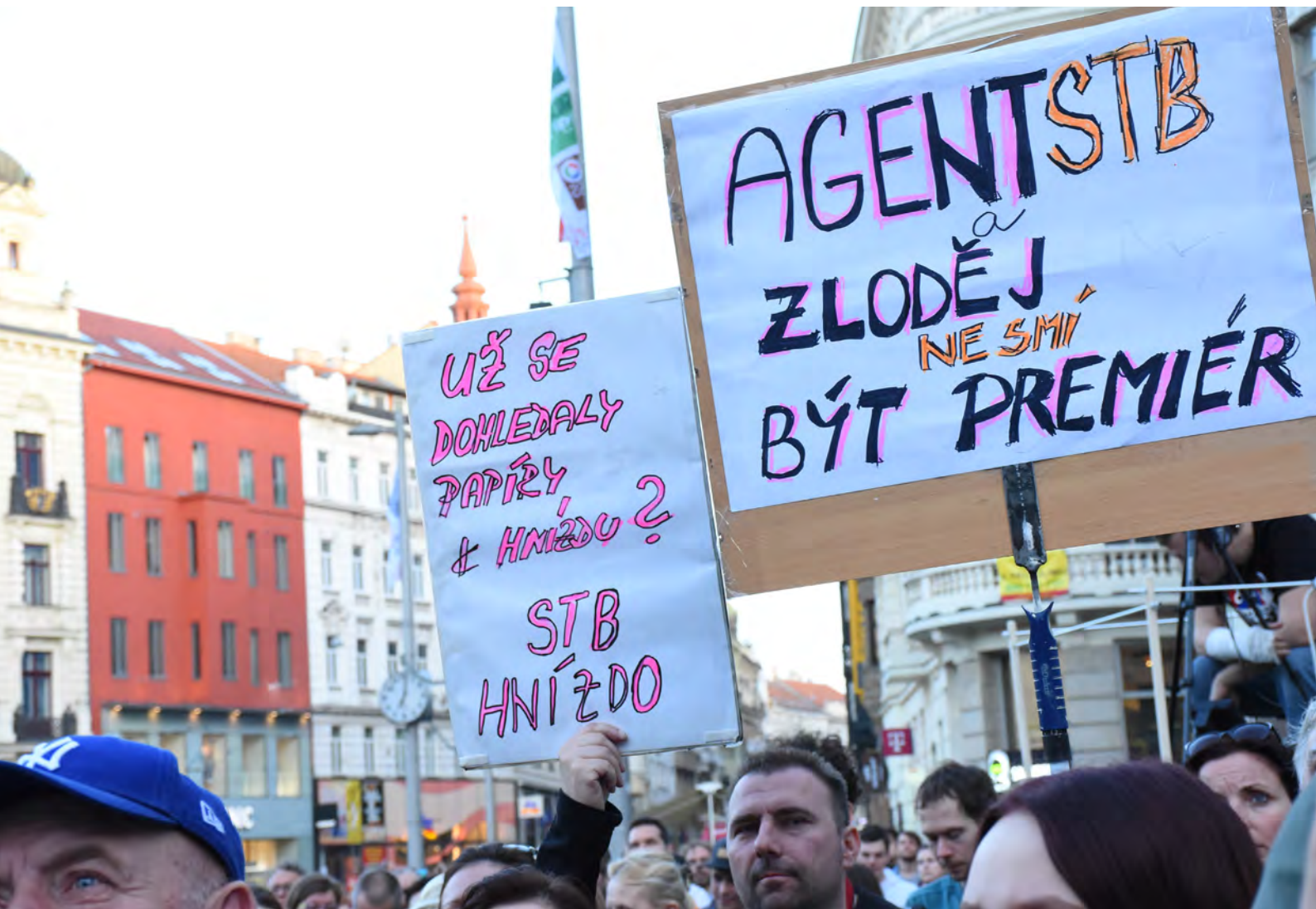
Protests against Andrej Babiš [3]

communist repressions requires a much broader investigation of the micro-histories of individual collaborations in their particular context.