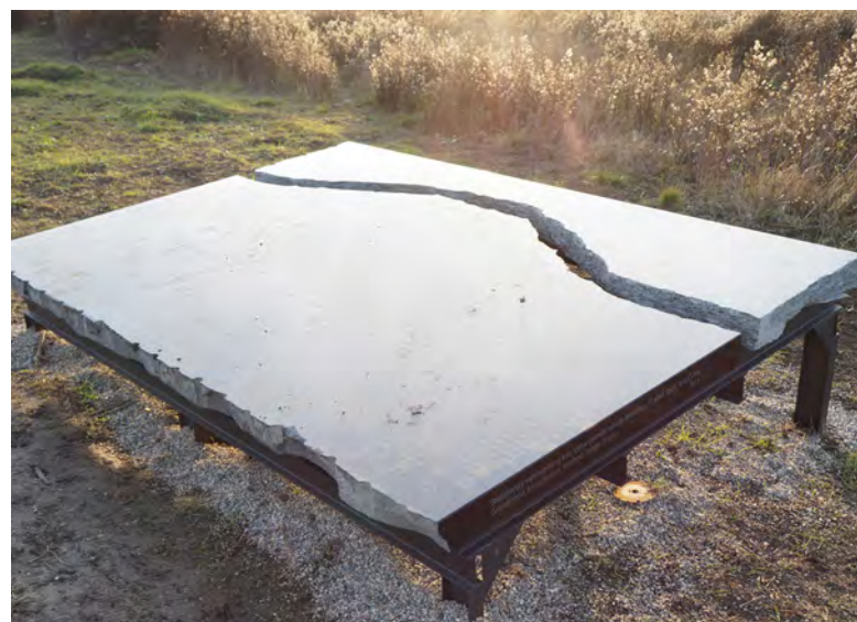
Iron Curtain Memorial in Slovakia [2]

Nevertheless, these legal proceedings showed major limits of the truth-revelation procedures. Firstly, the majority of the files were destroyed in the 1989 shredding. Another constraint of truth revelation is that these processes take place in a courtroom, focusing solely on the facts of evidence, not going deeper into the discussion of the extent of collaboration and responsibility for the crimes committed by individual collaborators. Full understanding of the