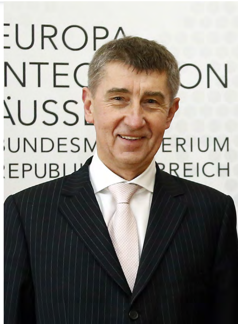
Andrej Babiš [1]

In Slovakia, the files of ŠtB officers and collaborators were open to the public only in 2002, with the establishment of the Nation's Memory Institute (NMI), an important institution responsible for revelation of truth. A similar institution was created in the Czech Republic in 2007, with a rather controversial name, the Institute for the Study of Totalitarian Regimes.