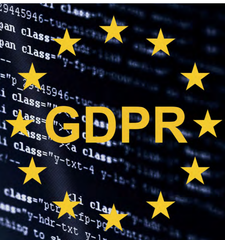
Illustration image [2]

went against the practice of the Hungarian Constitutional Court, the Curia, and the European Court of Human Rights (ECtHR).