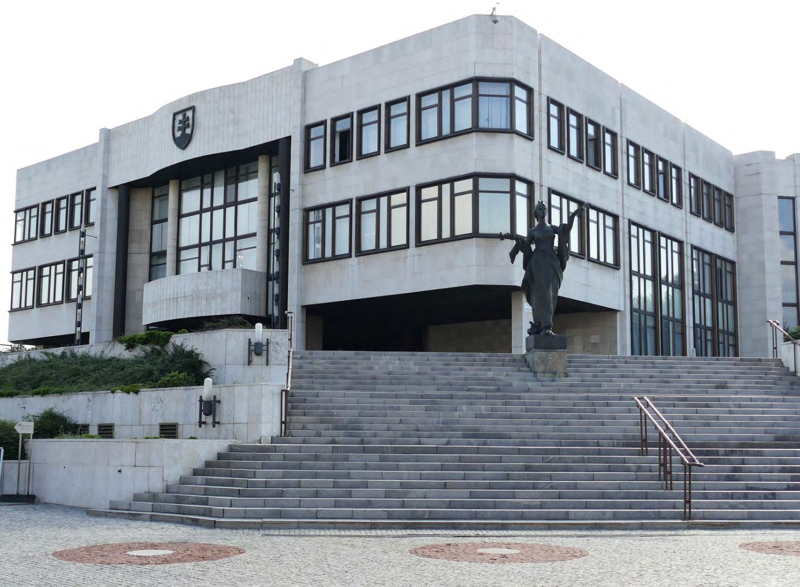
National Council of the Slovak Republic [6]

difficult to read, but may lead to the same result as in Poland - judges who understand what is expected, and who are forced or willing to adjust.