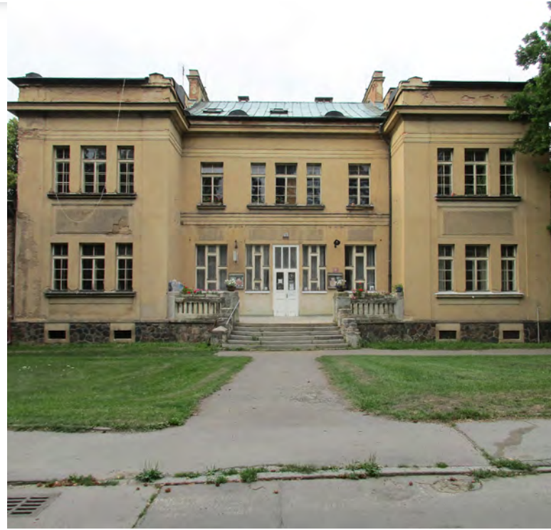
Psychiatric hospital Bohnice [1]

While human rights defenders call for the complete abolishment of net cage beds, some mental health profession-