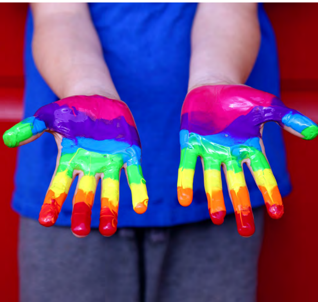
Illustration image [2]

Council of Europe. The Czech Republic signed this Convention in 2016 and should have ratified it in the first half of 2018. However, this task has not been accomplished to this day.