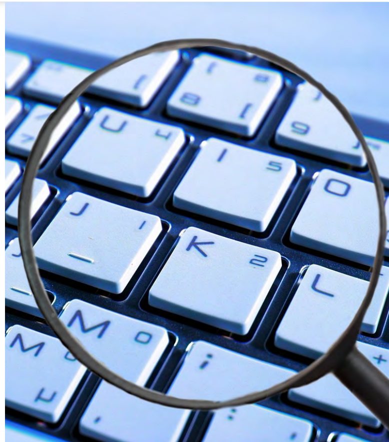
Illustration image [1]

The new mayor claimed that during the months preceding the October elections, the content of the issues of the municipal journal of Józsefváros was censored by Fidesz politicians, for instance by Máté Kocsis, MP of Fidesz and previous mayor (2009-2018), and by Botond