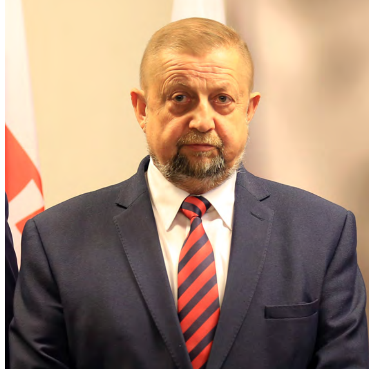
Štefan Harabin [1]

Mr. Harabin, a former Chief Justice of the Supreme Court in 1998–2003 and first Chair of the Judicial Council (2001–2003), became the Minister of Justice after the 2006 parliamentary election by a direct transfer from the posi-