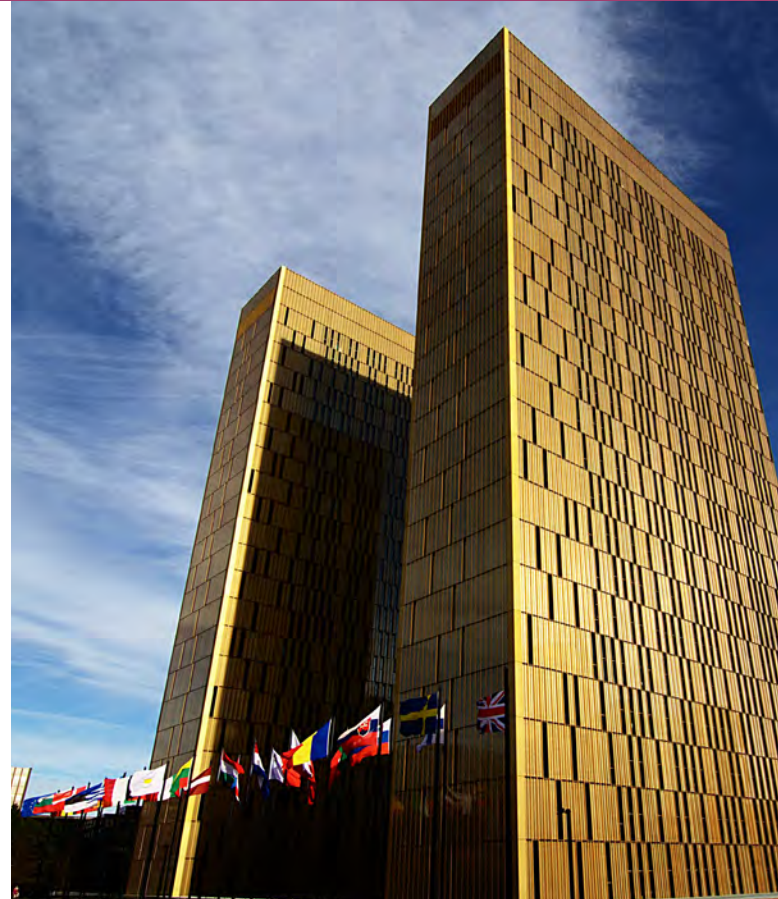
European Court of Justice [1]

The Labour Chamber of the Supreme Court asked the Court of Justice of the European Union (CJEU) by means of the preliminary ruling procedure to decide whether the