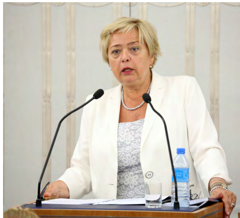
Ms. Małgorzata Gersdorf, First President of the Supreme Court [4]