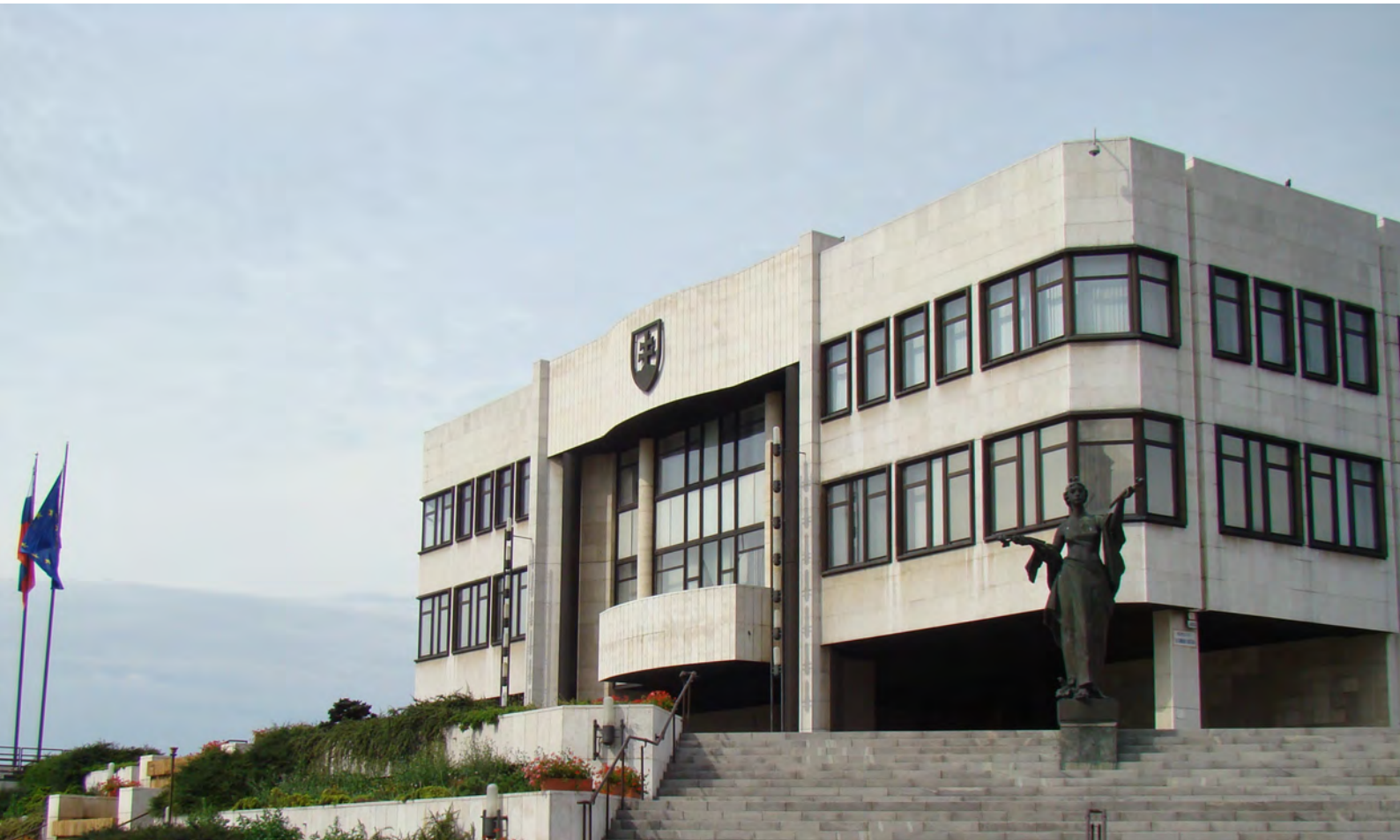
The seat of the Slovak parliament (National Council) [3]