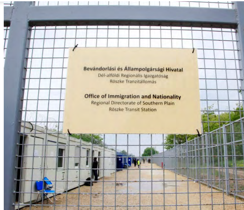
Röszke Transit Station, Hungary [1]

As collective expulsion is prohibited, asylum procedures must be conducted on an individual basis, considering