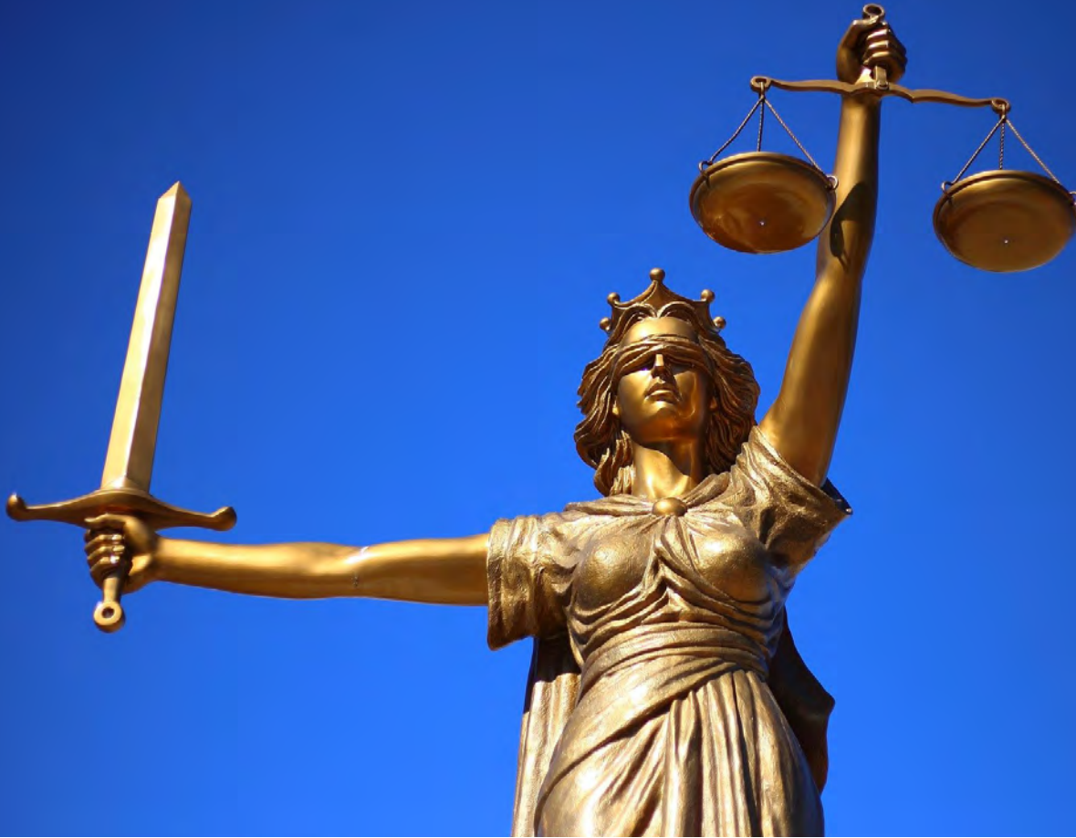
Illustration image [3]