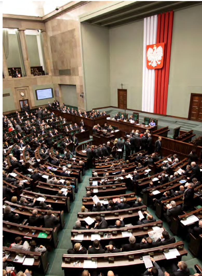
Polish Sejm [1]