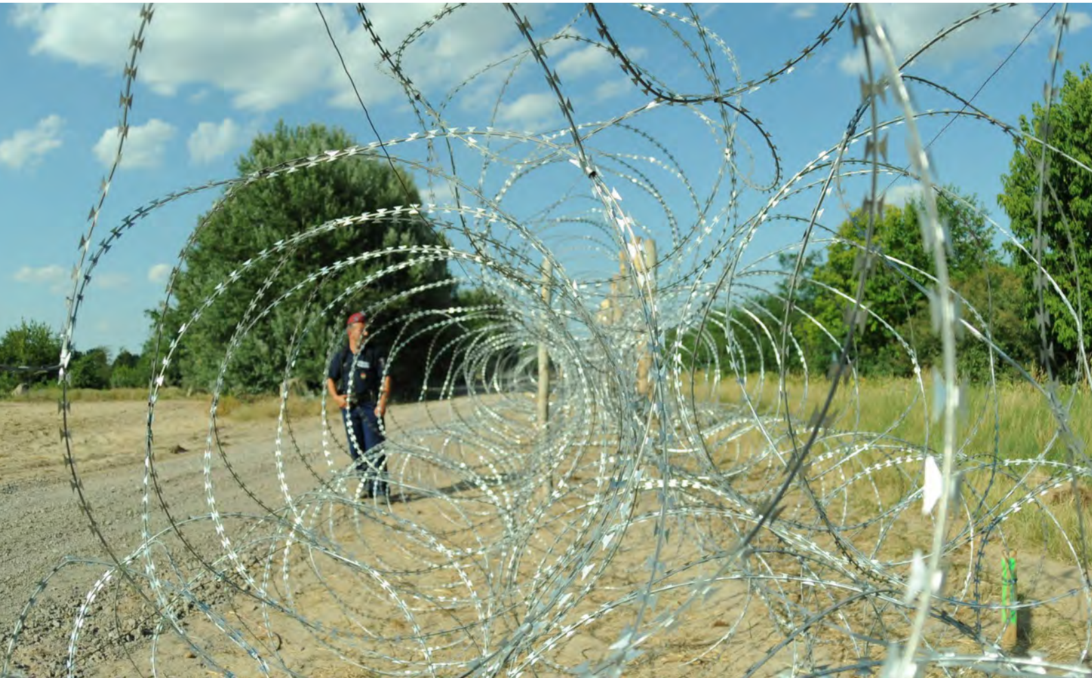
Hungarian-Serbian border barrier [2]

was not necessary to give a separate ruling under Art. 13 taken together with Art. 3 of the ECHR.[1] The Hungarian government appealed the decision.