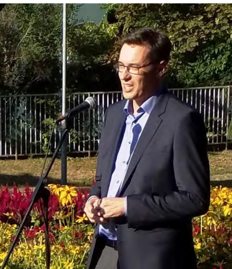
Gergely Karácsony, Mayor of Budapest [1]

His campaign stood in stark contrast to his opponent’s, who was endorsed by the populist right wing headed by Viktor Orbán. Political outlets predict that Karácsony is about to face a long battle against Orbán and his supporters. Therefore, it is not surprising that Karácsony actively seeks allies even beyond Hungary’s borders.