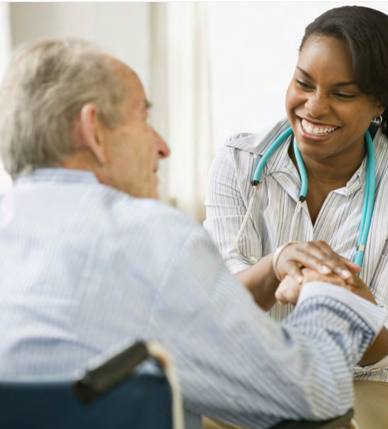
Illustration image [2]

physical restraint of people with psychological or intellectual disabilities.