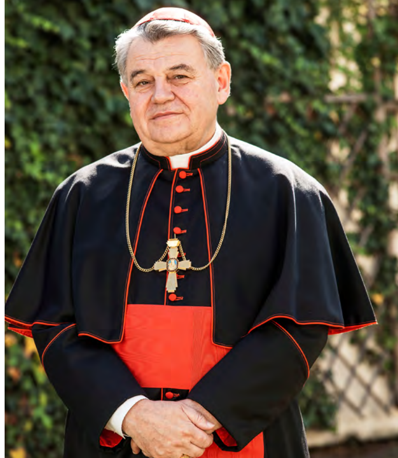
Dominik Duka [1]

In addition, a civil lawsuit was initiated by Cardinal Dominik Duka and his lawyer, who filed a false light action, arguing that these plays grossly offended their religious belief, dignity, and honour, as well as religious belief of all Christians and the Christian faith as such. Since they lost their case at the court of first instance, they filed an appeal to the Regional Court in Brno (hereafter referred to as the “regional court” or “the court”).[1]