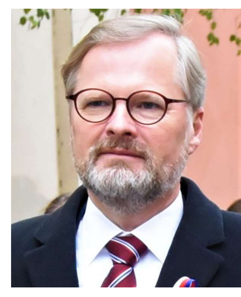
The government plans to phase out coal by 2033 [1]

GHGs contribute to the so-called greenhouse effect. The Earth's surface absorbs some of the energy from the Sun, while the rest of it is reflected in space. However, some of this reflected energy is trapped by GHGs, stays in the atmosphere, and continues to heat the Earth. The occurrence of GHGs and the rise in temperature are directly linked. Therefore, one of the most important measures to reduce the increase in temperature is to limit GHG emissions.