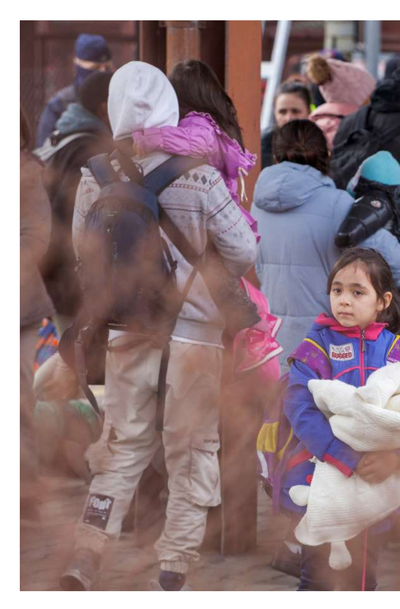
Lex Ukraine to speed up refugee intake [1]

It was not only politicians who expressed support for Ukraine. In many places across the Czech Republic, Ukrainian state flags were flown, and demonstrations were held in support of Ukraine. The largest of these was held by the association, the Million Moments for Democracy (Milion chvilek pro demokracii) in Prague's Wenceslas Square, with thousands to tens of thousands of people taking