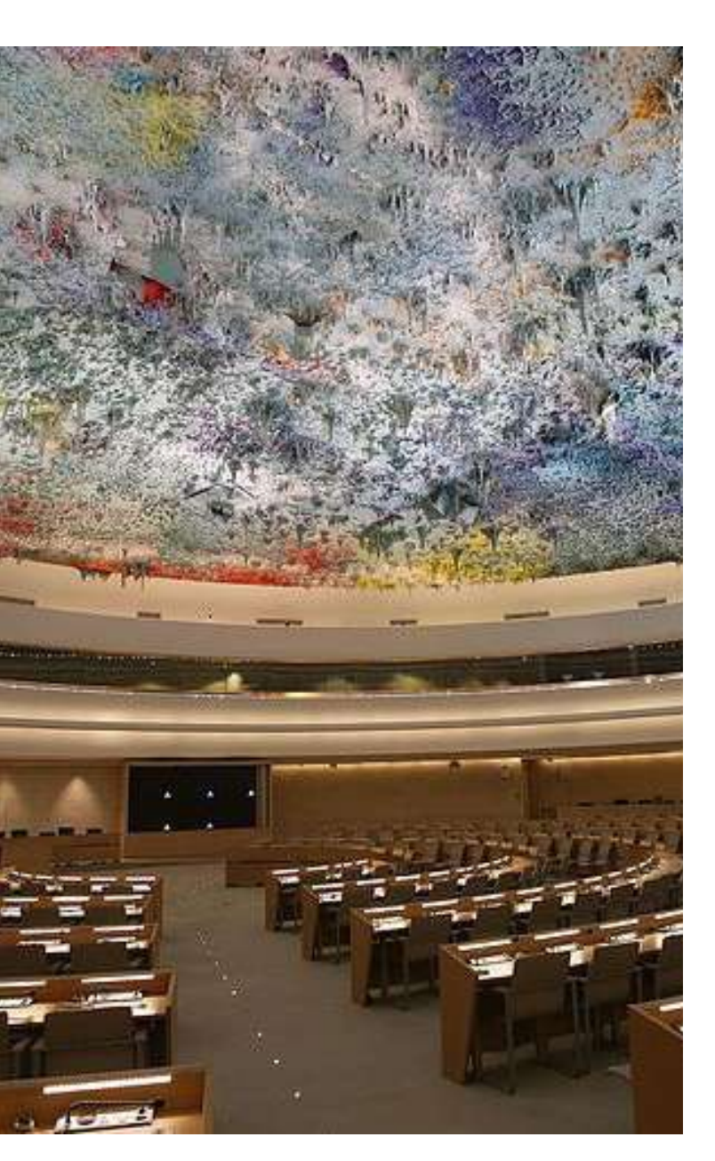
The Seat of the UN Human Rights Council, Geneva, Switzerland [2]

On the 10th of May 2022, the Czech Republic was elected to the Council by the UN General Assembly. One hundred fifty-seven members voted for its membership; 23 members abstained. The Czech membership started immediately with the election and will last until the end of 2023.