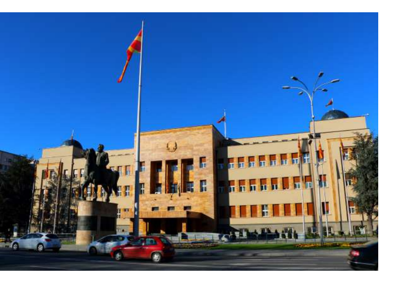
Northern Macedonia has agreed a compromise with Bulgaria [2]