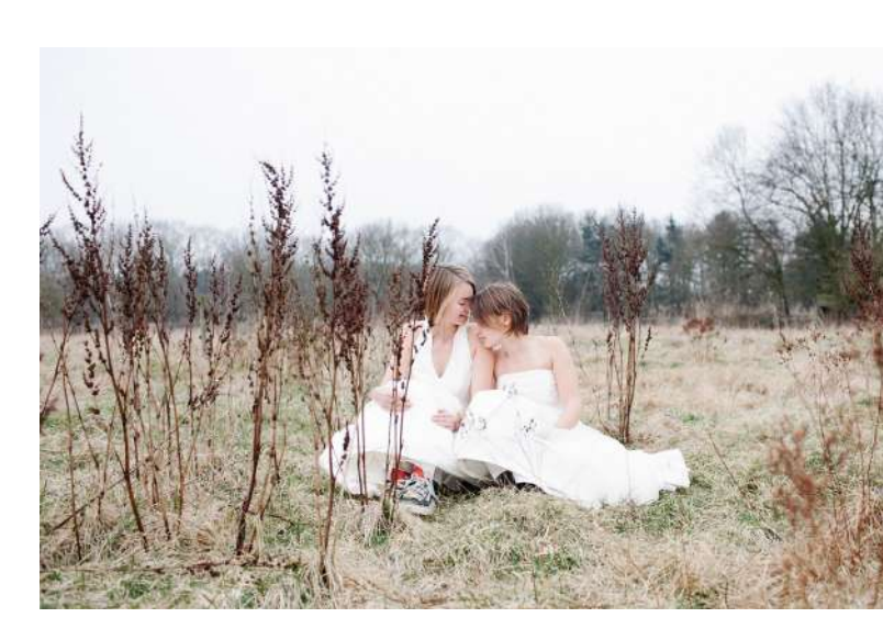
The bill intends to legalize same-sex marriage [5]