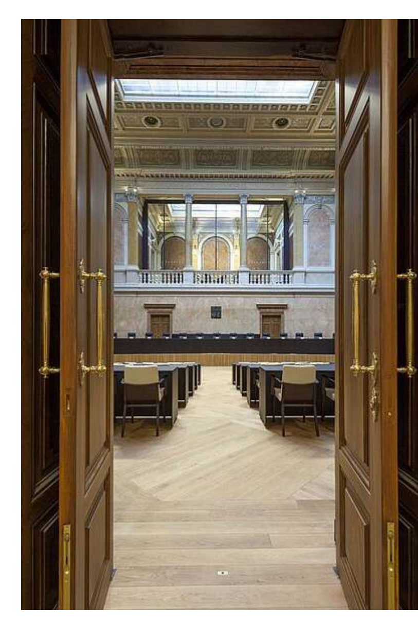
The Constitutional Court [1]

She applied to the competent administrative authorities to change the form of her birth number from male to female form, but the authorities rejected her request. Next, she filed a complaint before Czech administrative courts, but to no avail.