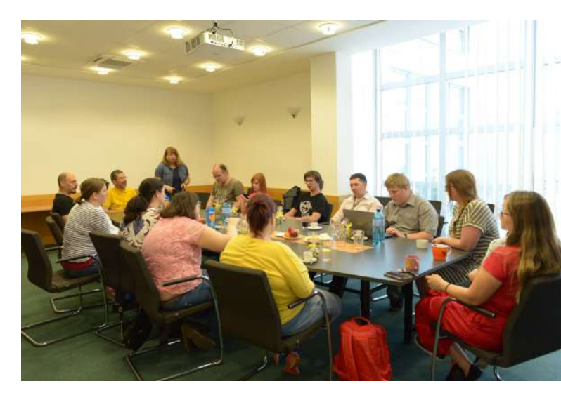
The self-advocates' meeting in June [4]

The CRPD body is still working hard to improve the situation in the Czech Republic for people with