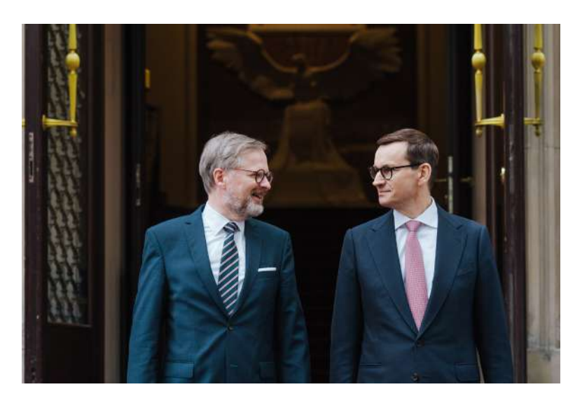
Petr Fiala and Mateusz Morawiecki, Prime Ministers of the Czech Republic and Poland [3]

The German side has also spoken out against the continuation of the mining. The deepening negative impacts of mining have particularly affected the village of Zittau, which is threatened by land subsidence. The German side has therefore started to demand improvements to the isolation wall.