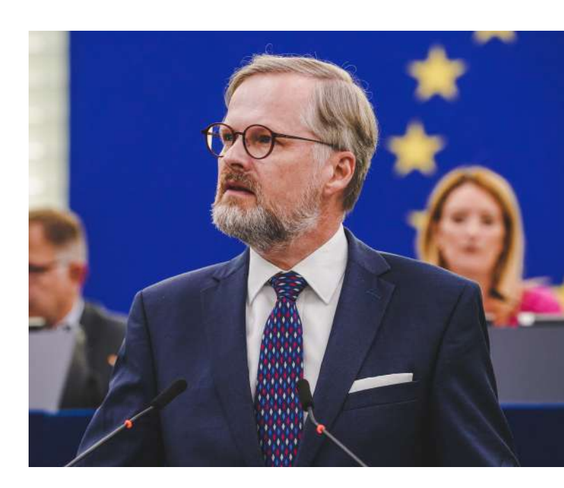
Prime Minister Fiala on the priorities of the Czech Presidency [1]

The Council suspended an agreement on facilitating the issuance of visas to citizens of the Russian Federation. For Russians wishing to enter European countries, this results in a fee increase from 35 to 80 euros, the obligation to submit additional documents, an extension of the visa processing time and stricter rules. Meanwhile, the Czech Republic suspended the issuance of visas for Russian citizens in February and, as of 25 October, denied entry to Russians with Schengen visas who come to the Czech territory for tourism, sport or cultural purposes.