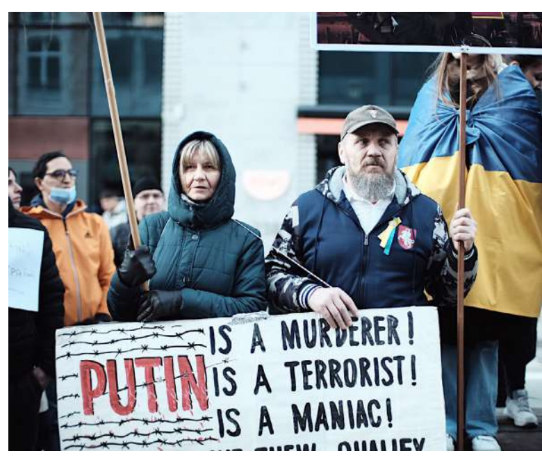
War crimes can also be prosecuted in the Czech Republic [2]

At the same time, the Ministry of the Interior has been preparing a methodological manual for the Czech Police on how to address the use of the Z symbol in support of the Russian invasion. Presumably, this symbol should be treated similarly to the Nazi swastika. However, this is a new symbol and therefore any criminal offence will be very difficult