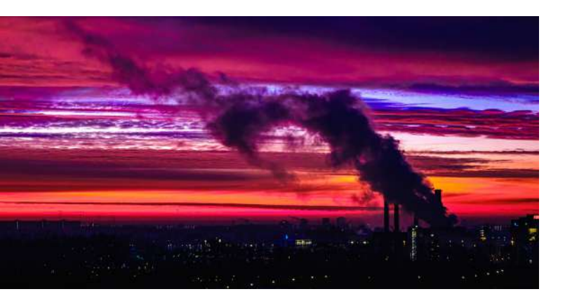
Temperature increase means a risk of flooding [3]

ty generation. According to 2015 data, the Czech energy sector is dominated by coal-fired resources, which supply almost 60% of electricity and a large part of heat through both district and individual heating.