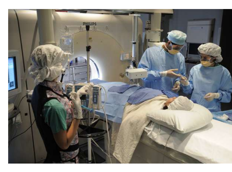
Some women suffer from various diseasesafter sterilization [3]

of the violation of the victims' human rights.