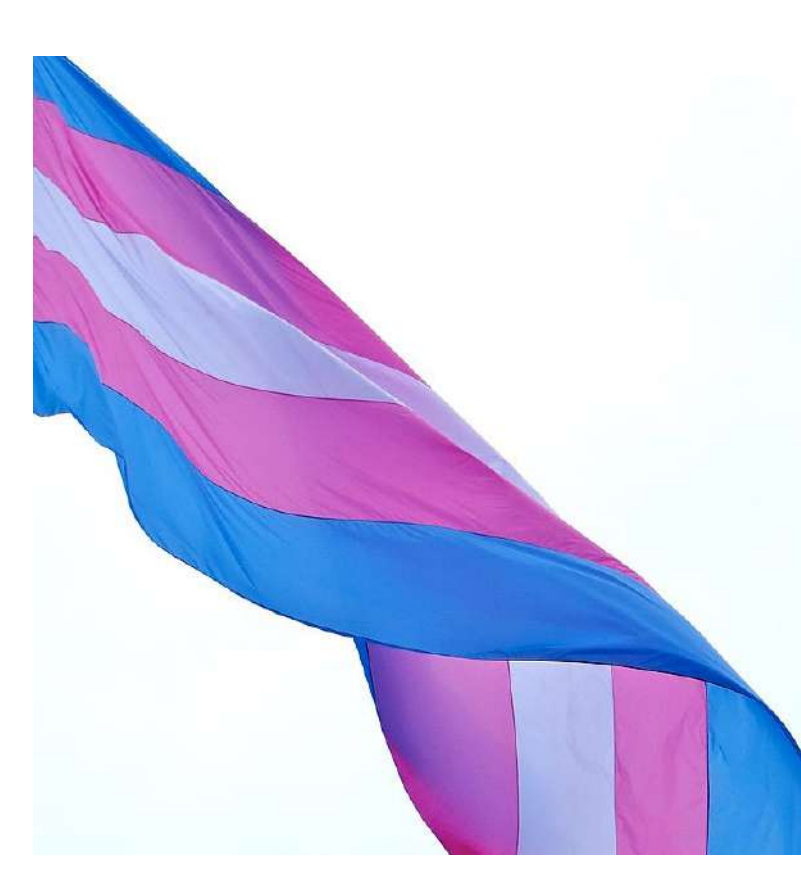
The decision was announced on International Transgender Day of Visibility (31st March) [3]