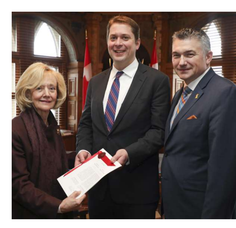
Senators in Ottawa, Canada, passed the Magnitsky Act[1]

Browder commented on the creation of the Magnitsky Act: "The Russian government absolutely refused to do justice in the case of Sergei Magnitsky. It wanted to cover up the murder. It valued the people who worked on it. It gave them state honors. Vladimir Putin himself was personally involved in the retelling of the case. So I said, if we can't get justice in Russia, we have to try outside Russia."